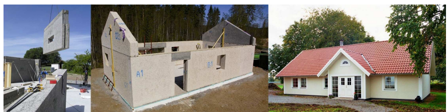
Large WWC Wall Element Building System