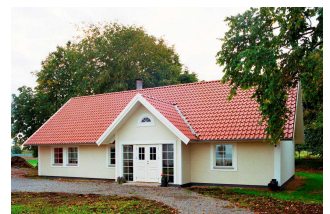
Large WWCB Element Building system