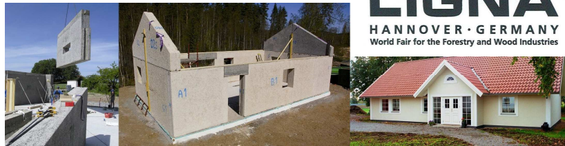
Large WWC Wall Element Building System

LIGNA HANNOVER · GERMANY World Fair for the Forestry and Wood Industries